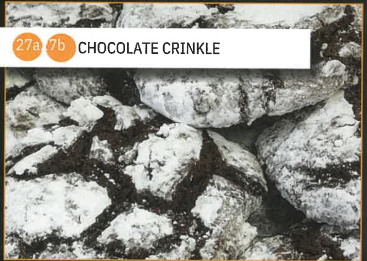
27a 27b CHOCOLATE CRINKLE