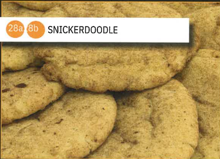
28a 28b SNICKERDOODLE