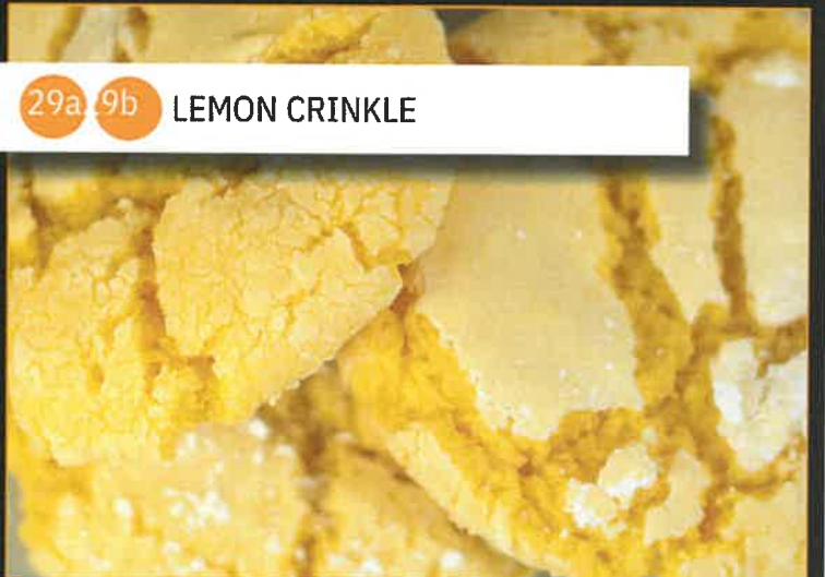
29a 29b LEMON CRINKLE